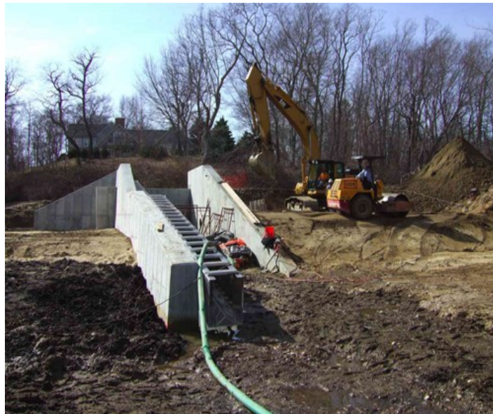
Example Fish Passage Project: Upper Shawme Pond Fish Ladder

The goal of the RCC is to complete more restoration projects around the Cape by serving as a resource and management center. The RCC also aims to build public support for restoration to improve our natural resources and environment.