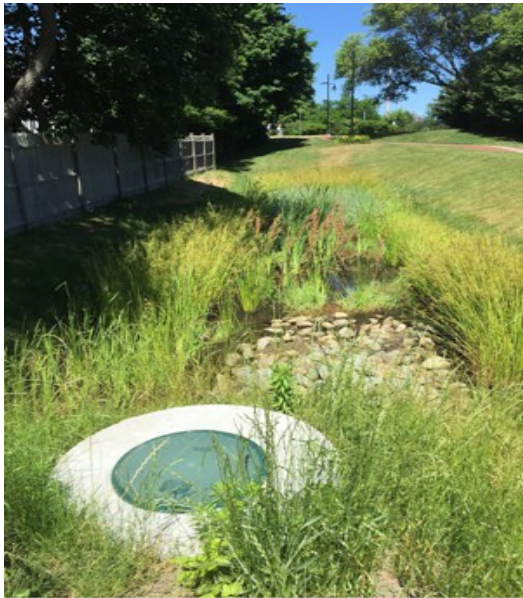
Example Stormwater Installation: Hyannis Harbor

In 2015, with funding from The Cape Cod Foundation through the Dolphin Fund for Cape Cod, Environmental Trust Fund of Cape Cod, Permanent Freshwater Fund, the Patricia Gidley-Price Fund, and the generous support of our membership, APCC established the Restoration Coordination Center (RCC) to help towns on Cape Cod with prioritization, planning, implementation and management of restoration projects. APCC met with staff from all 15 Cape towns and identified over 140 restoration projects that towns want to undertake, but lack the resources to implement. These projects include restoration of impaired salt marshes, fish runs and shellfish beds, as well as stormwater projects to improve water quality and habitat.